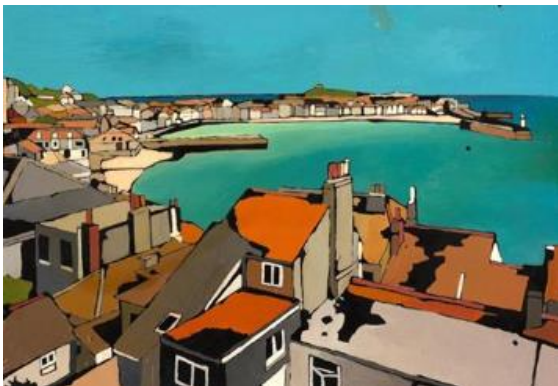
Tracey Oldham St Ives Rooftops (Pro Markers)