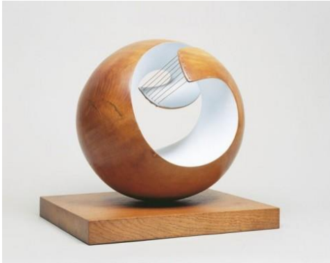
Barbara Hepworth Pelagos (Sculpture)