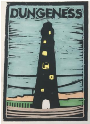
Miss Porter Dungeness 2021 (Lino cut)

Observation = you making work directly from what you see First hand image = a photograph that you have taken