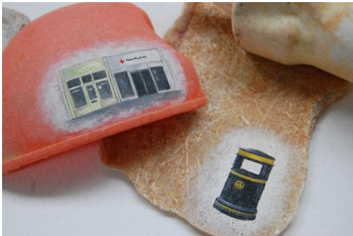
Example of painting on to found objects UCA student 2014

Must be able to identify a place of importance